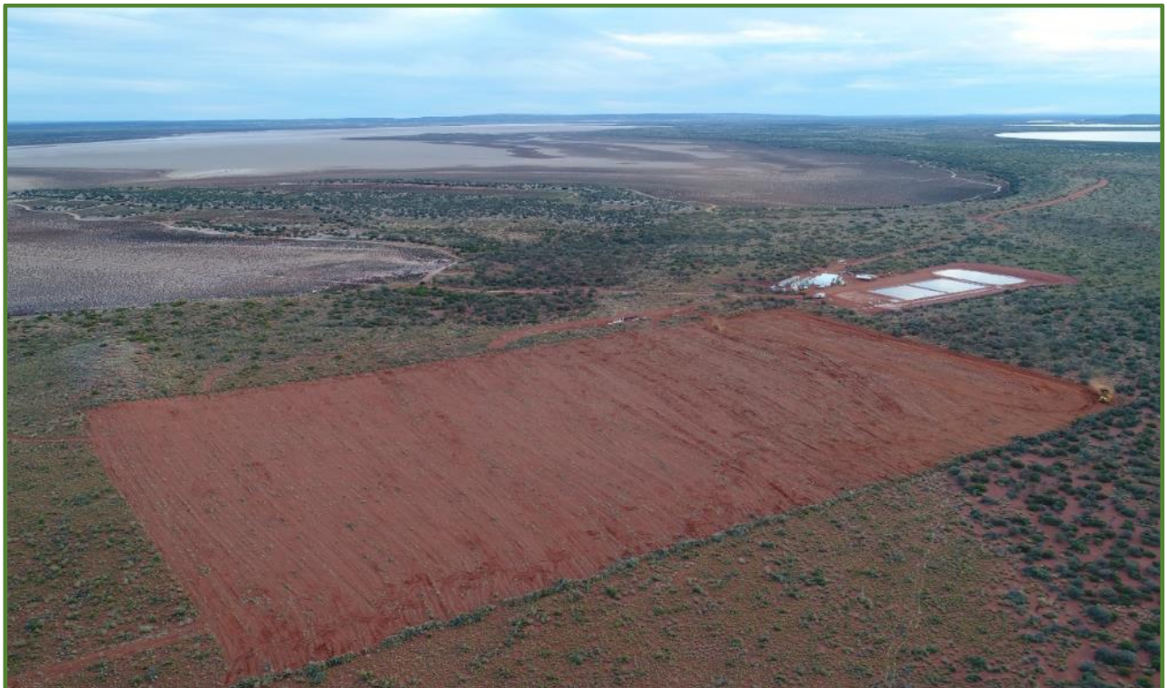
Pilot Pond Area Under Construction

Kalium Lakes Limited (KLL) announced today that construction of the Large Scale Pilot Evaporation Ponds has commenced at the Beyondie Sulphate Of Potash Project.