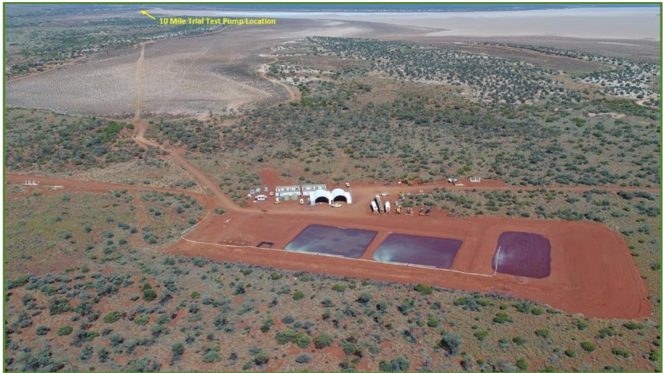
Pond Construction Verification and Leakage Trial Area