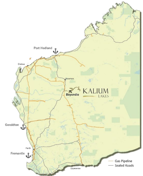
Strategic Location Close to Gas Pipeline, Sealed Roads and Ports