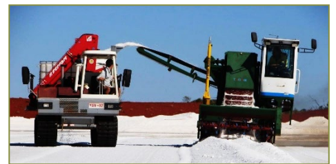
Pilot Scale Trials Complete with More Than 10,000 Tonnes of Salts Produced